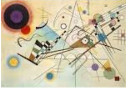
Composition 8 , by Kandinsky 1923